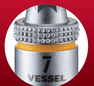
Color-coded by size.